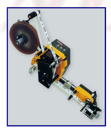
3610 Standard Applicator