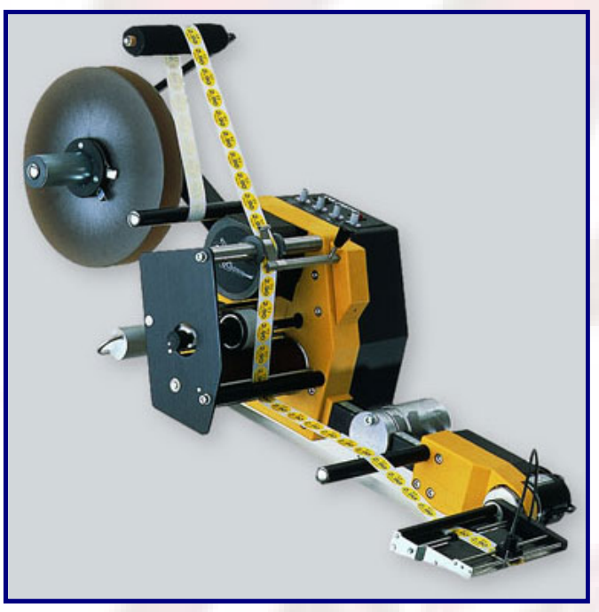
6610 Midrange Applicator