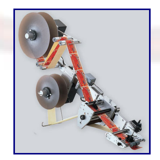
9100 Ultra High-Speed Applicator